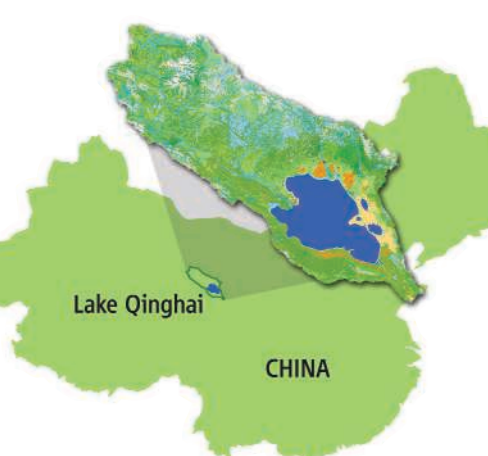
Jewel in the crown. Lake Qinghai, affected by large agricultural projects in the past, is the focus of an environmental remediation program.

restore the region's crown jewel-Lake Qinghai, or Qinghai Hu—and surrounding lands. Embracing 30,000 square kilometers, the project includes a slew of tasks: to curtail grazing on grasslands, control rodents and insect pests that damage alpine meadows, protect wetlands, curb desertification, plant trees and shrubs, protect biodiversity, and construct small towns in which nomadic herders and